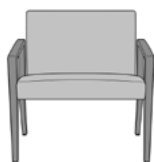
MDAB34G 34W 27D 35H 26AH