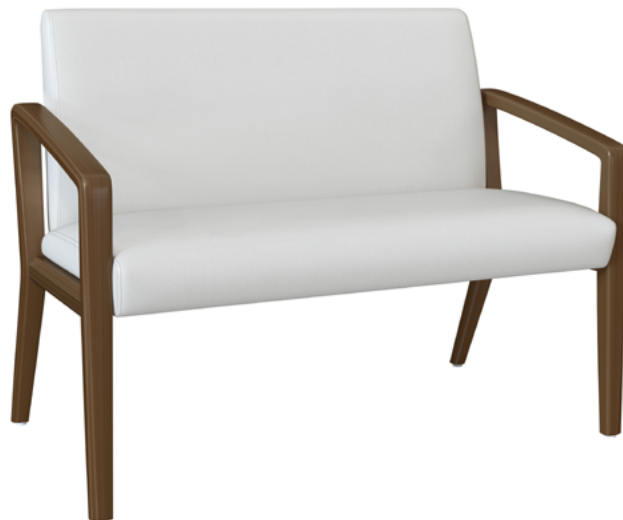
Model: MDAB46G 46W 27D 35H 41.5SW 18.5SD 19SH 26AH

The Modena Bariatric 46" with Flex Back provides extremely comfortable healthcare waiting location for one or two. Reinforced steel under the seat supports 750 pounds. The flex frame connects from the seat of the chair to the back and consists of four custom brackets and horizontal support. The seat, arms and legs remain stationary to deliver ergonomic support as the user changes position during waiting periods. The single back and seat cushion are just wide enough for a parent and small child. This Modena works well in lobbies, lounges, reception areas and emergency waiting rooms.